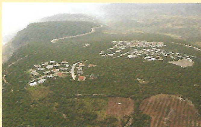
Aerial View – Har Halutz, 2005

Har Halutz was originally settled by a gar'in (dedicated group) that was established in the U.S. during the early 80's under the auspices of the Israel Movement for Progressive Judaism (Reform Movement). The original families that moved up to the Har in 1985 consisted of a mix of English speaking immigrants and native Israelis. Throughout the years we have continued to attract an interesting mix of families from around the world, although the majority of our new members are young Israeli families.