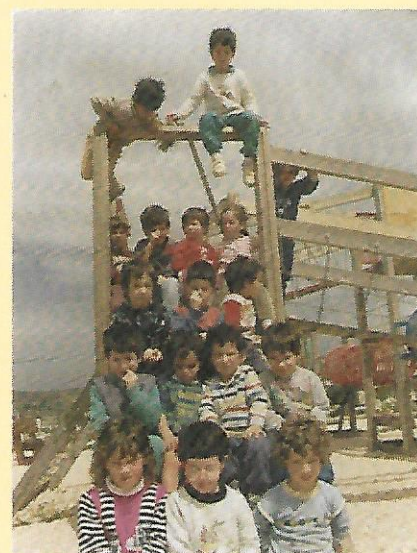
Har Halutz Pre-School

Throughout the year, the Har Halutz youth participate in the Noar Telem Reform youth movement. During the summer, they attend the Noar Telem sleep-away camp in Israel. Har Halutz has also hosted many NFTY summer groups.